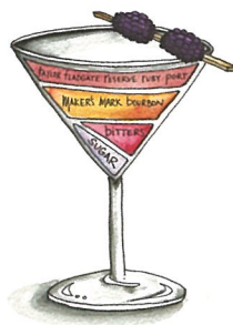
PORT OF MANHATTAN

dekuyper white menthe, godiva white chocolate liqueur and coffee topped with whipped cream 9