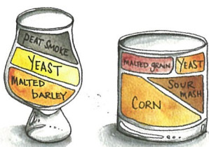
SINGLE MALT SCOTCH SMALL BATCH BOURBON