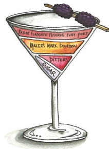
PORT OF MANHATTAN